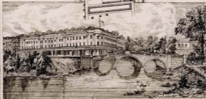
Victoria Terrace & Baths