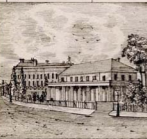
The Royal Pump Rooms & Victoria Baths.