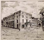
The Regent Hotel.